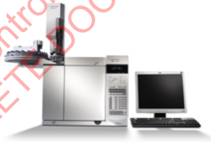
Figure 2. Gas Chromatograph

1.3.1 Agilent 7890A Gas Chromatograph (GC) configured with a Flame Ionization Detector (FID) (Figure 2).