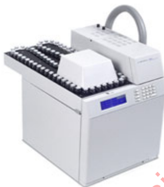
Figure 3. G1888 Headspace Analyzer